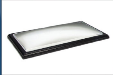
VCM Acrylic Dome