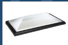
VCM Acrylic Ridgelite