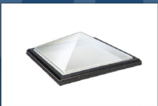
VCM Acrylic Pyramid