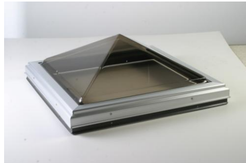
Dayliter Pyramid (shown in bronze acrylic on ATCM frame)