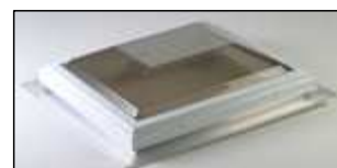
Acrylic Flat top Pyramid