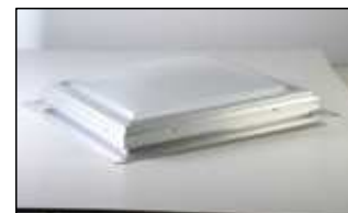
Low Profile Acrylic Dome