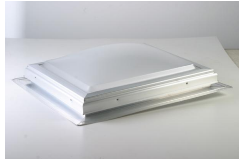
Dayliter MSF Dome (shown in translucent white acrylic)

Standard and Custom Sizes are available.