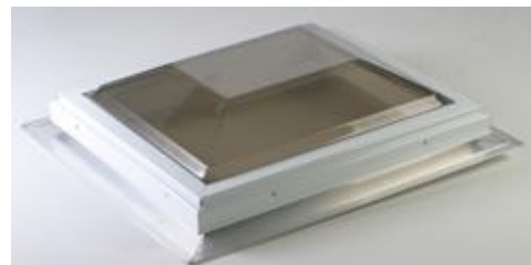
Dayliter MSF Flat Top Pyramid (shown in bronze acrylic)