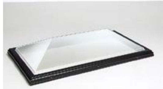
Dayliter Ridgelite VCM