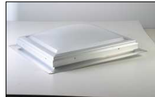
Low Profile Acrylic Dome