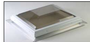
Acrylic Flat top Pyramid

* All skylights over model 5276 MUST be done in an ATCM frame and can only be done in Acrylic Shaded area = over 24 sq ft.