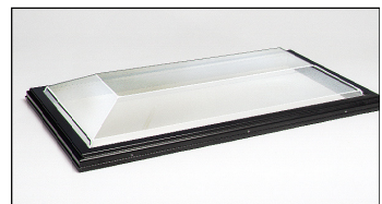
VCM Acrylic Flat Top Pyramid