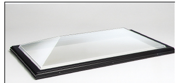
VCM Acrylic Ridgelite