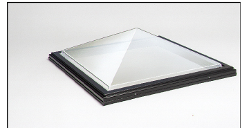
VCM Acrylic Pyramid